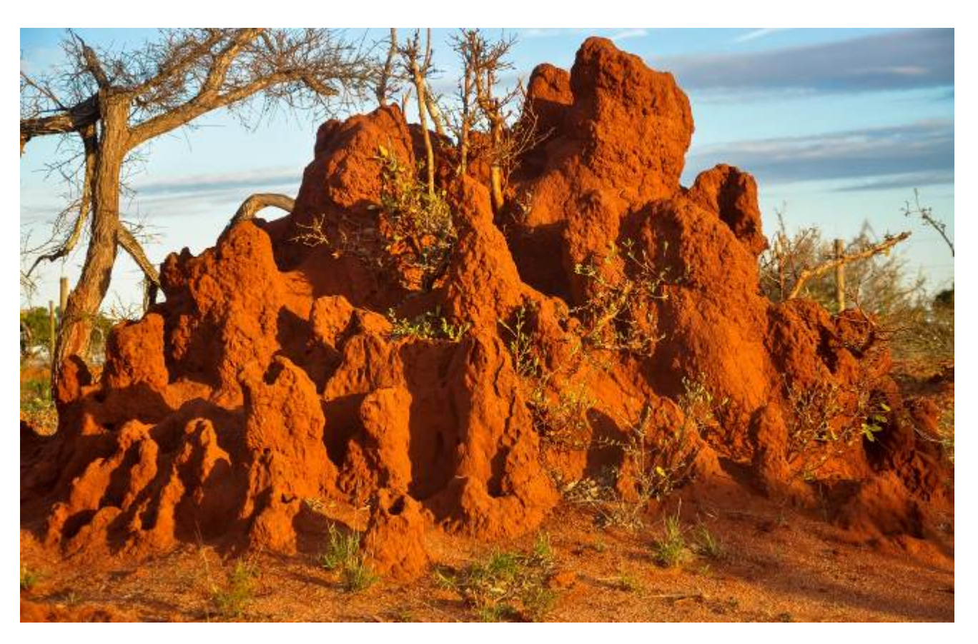
Overnight at Kilaguni Serena Lodge. (Meals: Breakfast, lunch & dinner)