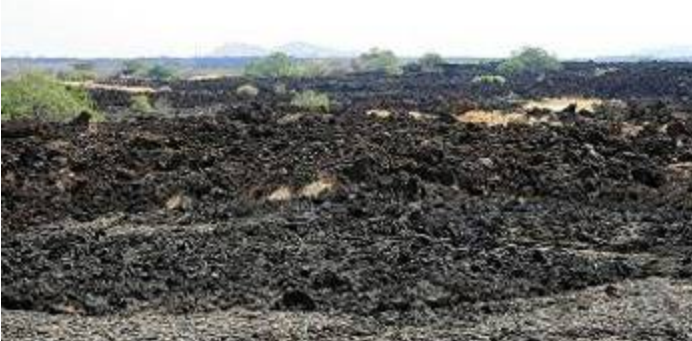
Spend the next seven days with game viewing activities and exploring the expansive park.

At just over 21,000 km sq. Tsavo is the largest National Park in Kenya and because of its size the park was split into two, Tsavo West & Tsavo East. .