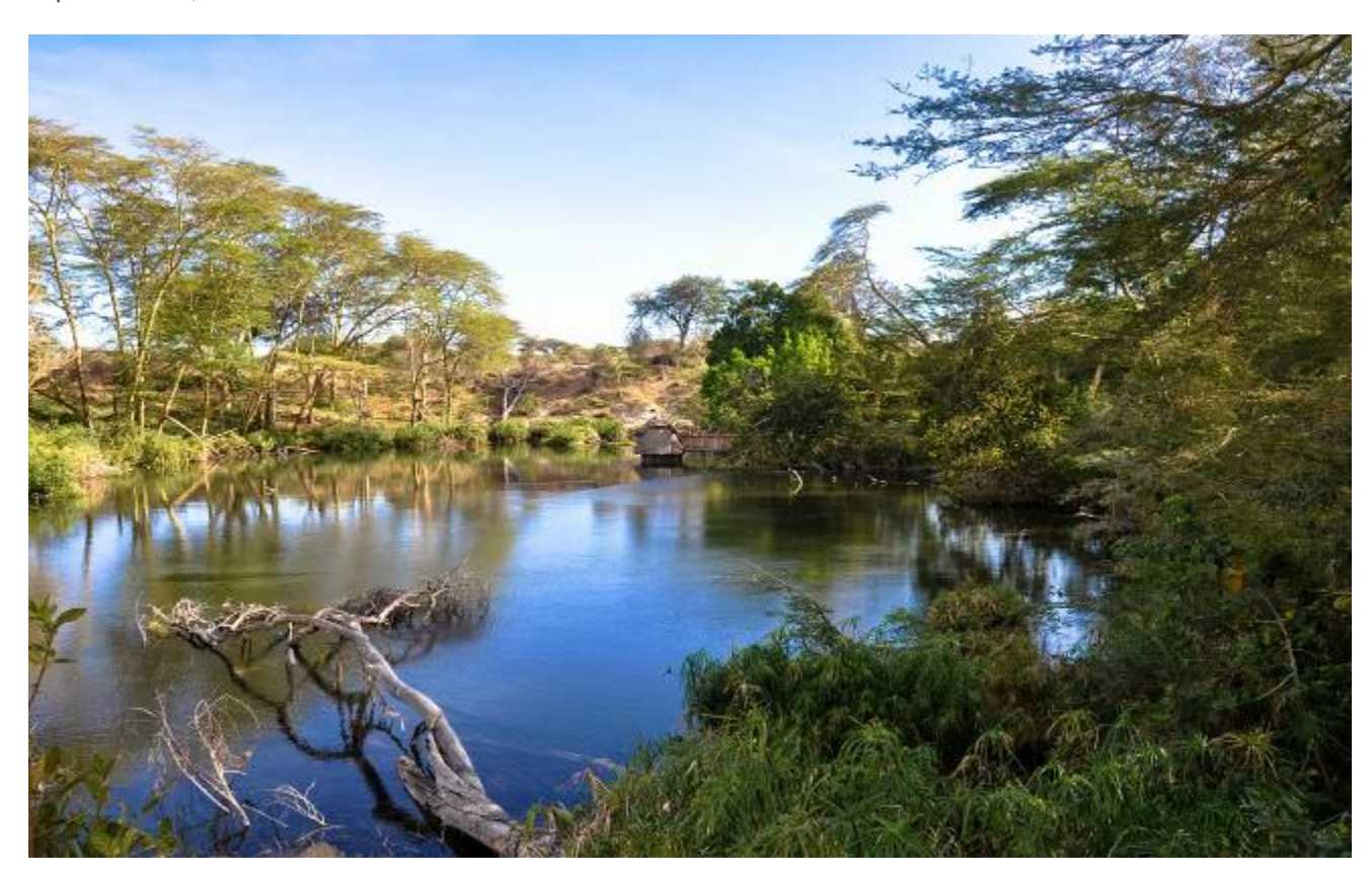
"Land of Lava, Springs & Man-Eaters"

At just over 21,000 km sq. Tsavo is the largest National Park in Kenya and because of its size the park was split into two, Tsavo West & Tsavo East. .