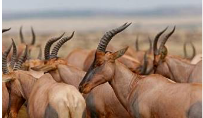
Spend another day game viewing in the reserve.