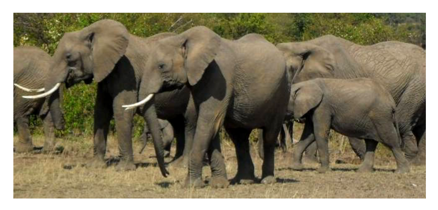
8<sup>th</sup>, 9<sup>th</sup>, 10<sup>th</sup> May: MASAI MARA NATIONAL RESERVE