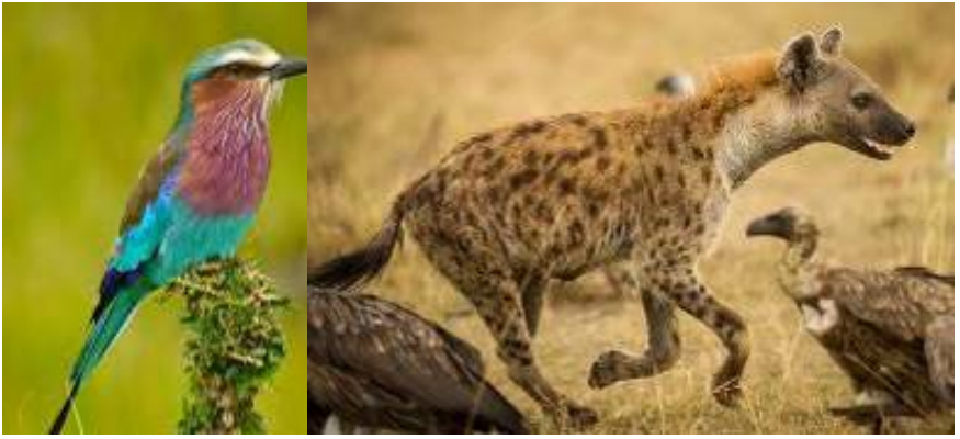
Masai Mara is one of Africa's greatest wildlife reserves. Acacia dotted plains, tree-lined rivers and woodlands are abundant with wildlife and an array of birdlife. Game viewing is spectacular year